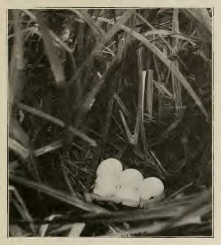
NEST AND EGGS OF LEAST BITTERN

While the list may appear as incomplete, the draining of the country makes it impossible to obtain any further data under the old conditions, and it is deemed advisable to publish it at this time as an approximate list of the nesting species of the region. It might be said that the only species noted in